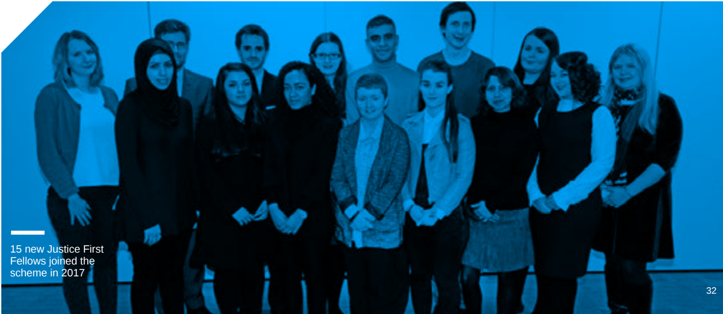
15 new Justice First Fellows joined the scheme in 2017

Supporting Pathways to Law programme which works to inspire and support academically-able year 10 and 11 students, from nonprivileged backgrounds who are interested in a career in law.