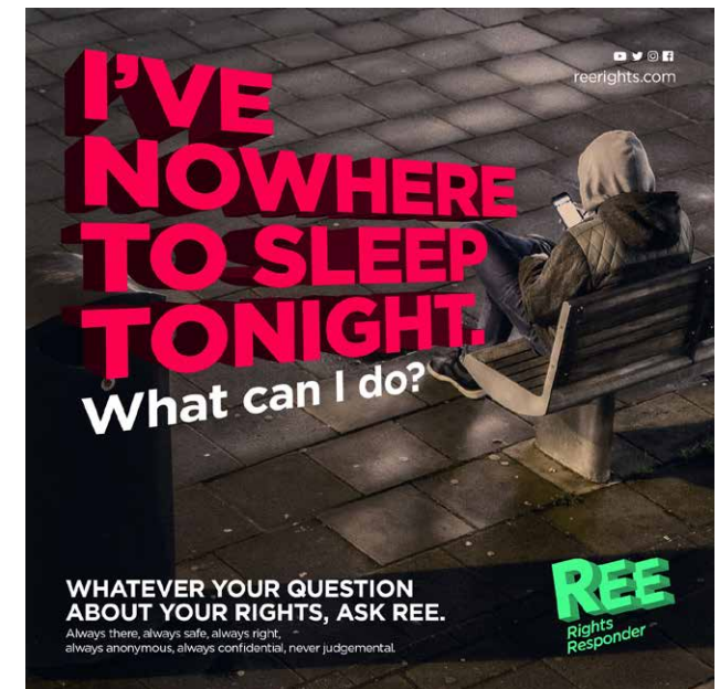
Northern Ireland's Children's Law Centre developed a chatbot giving young people easy access to legal information.