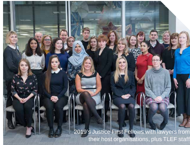
2019's Justice First Fellows with lawyers from their host organisations, plus TLEF staff

This year, another 13 fellows were appointed, taking the number of posts created by the scheme to over 60, with more to follow next year. Thirty-two fellows from the first three rounds have now completed their training: 30 are qualified as solicitors and two as barristers. We have been aware since the outset of the scheme that it will not be enough to create