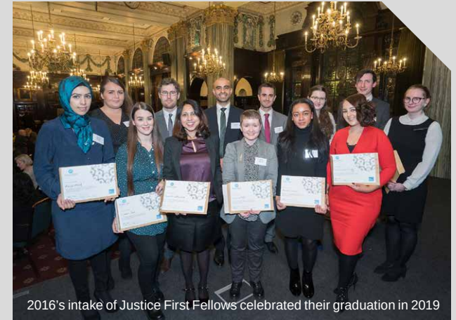
2016's intake of Justice First Fellows celebrated their graduation in 2019